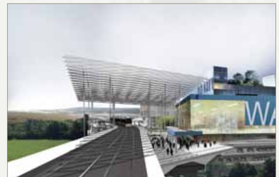
Visioning Rail Transit in Northwest Arkansas: Lifestyles and Ecologies

University of Arkansas Community Design Center Visioning Rail Transit in Northwest Arkansas: Lifestyles and Ecologies is a 162-page advocacy planning document envisioning smart growth development opportunities through light rail transit at the regional scale. Before the economic downturn, Northwest Arkansas (NWA) was the nation’s sixth fastest growing region. This area of 350,000 people is still expected to double its population within the next 15 years, growing to more than one million by 2050.