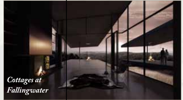
Cottages at Fallingwater