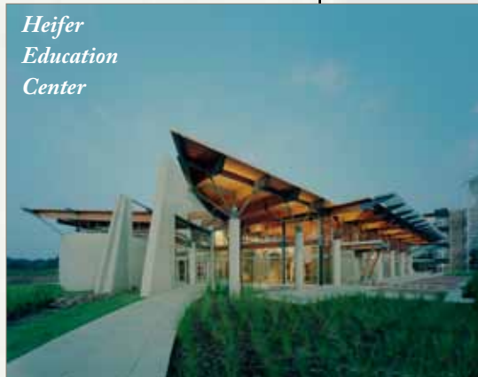
Heifer Education Center

Little Rock, AR Polk Stanley Wilcox Architects As part of the second phase of a four phase master plan, world hunger organization Heifer International’s Education Center acts as a teaching tool as it weaves wetlands with hands on learning to expand environmental stewardship into the public realm, while also serving as a beacon of hope for world hunger efforts.