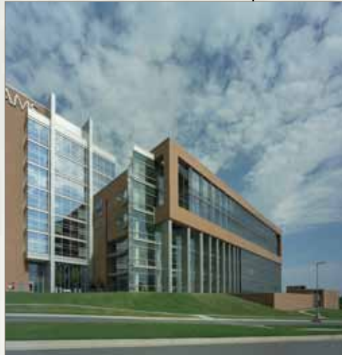
UAMS Psychiatric Research Institute