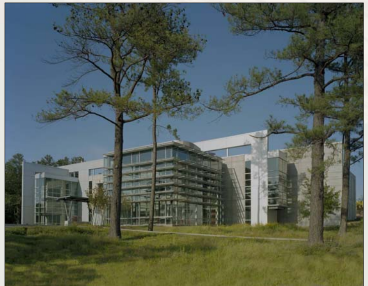
The 2007 Member Choice Award went to Polk Stanley for the Acxiom Central Arkansas Data Center (above).