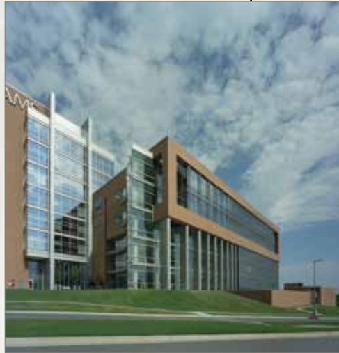
UAMS Psychiatric Research Institute

Little Rock, AR Polk Stanley Wilcox Architects The University of Arkansas’s five-story Psychiatric Research Institute consolidates psychiatric care in Pulaski County into a single facility for use in research, education, and clinical care, while breaking the “institutional” stigma often associated with mental healthcare facilities through its unconventional aesthetic use of glass and transparency.